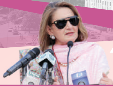
MRS. SAMINA ARIF ALVI First Lady, Islamic Republic of Pakistan