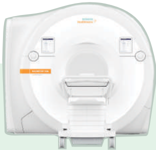
State-of-the-art MRI (Siemens 3 Tesla) for Precise & Quality Imaging

Shifa International Hospital has invested in the latest diagnostic equipment & technologies for precise and accurate disease diagnosis which leads to better treatment outcomes. Shifa Radiology Department is managed by an internationally experienced team of Radiologists and skilled technologists to provide best quality imaging, diagnostic, and treatment services by ensuring maximum care and patient safety.