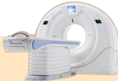
Latest CT Scan (Toshiba 640 Slice) for Precise & Quality Imaging

Toshiba Aquilion One 640-Slice Dual Energy Spectral CT