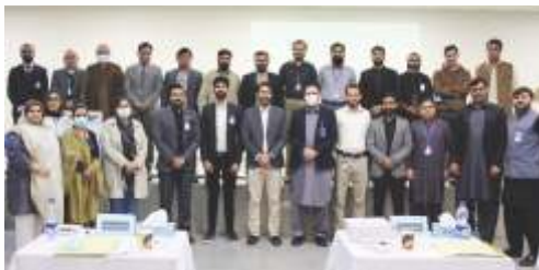
Leadership Development Program (LEADS) by Human Resource Department