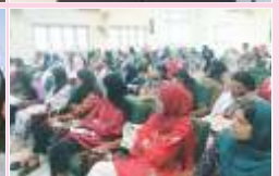
Breast Cancer Awareness Seminar at Fatima Jinnah University