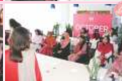
Breast Cancer Awareness Seminar at MRS Technologies.